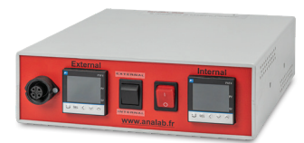
Programmable Dual Controller Regulator