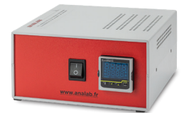
Non-programmable Regulator with Timer